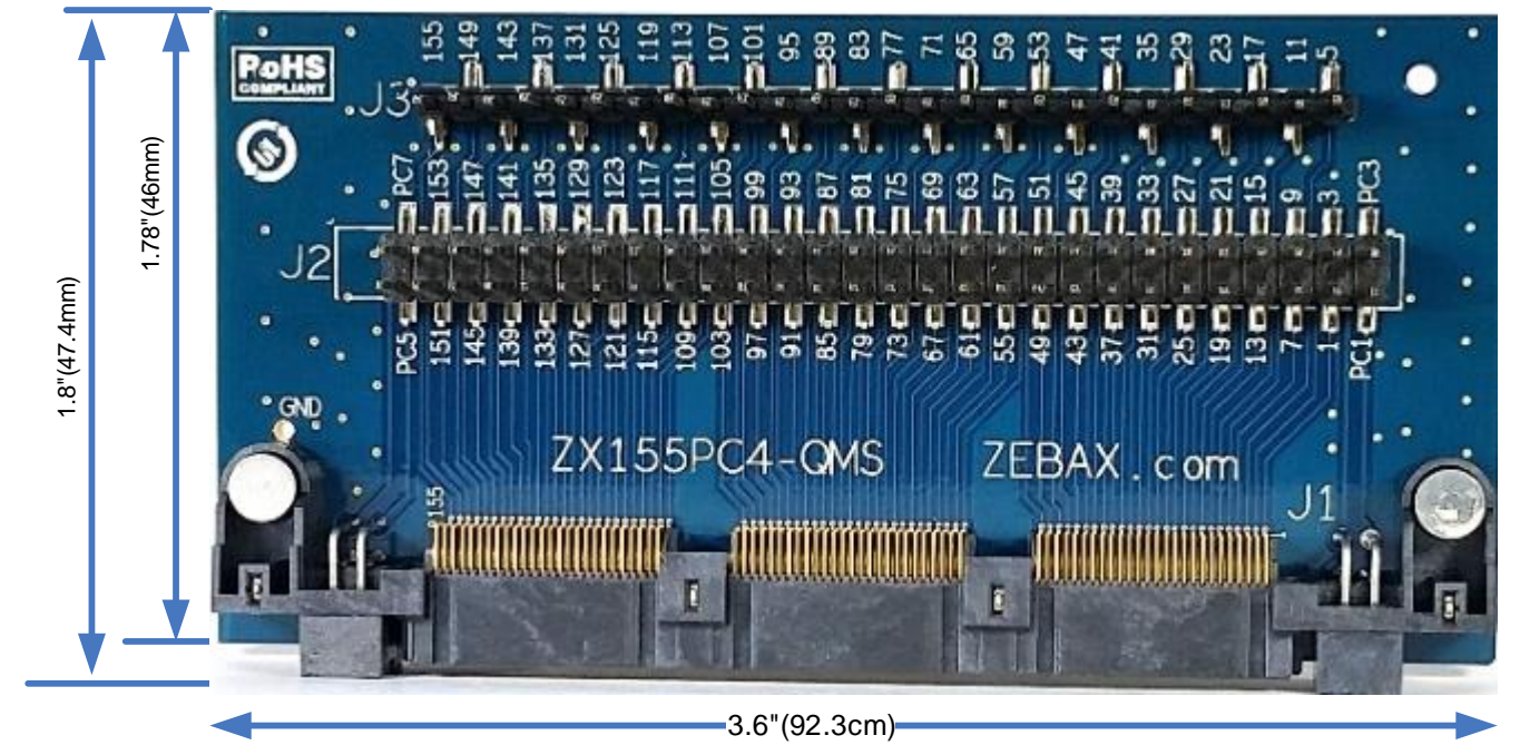
QMS/QFS PC4 terminal ( PC1 .. PC8 ) assignments – front view - 2 bank connector is shown

Headers: 0.1" (2.54mm) center, 0.025" SQ with 0.22" (5.58mm) post height